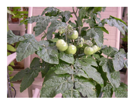
Tiny Tim 9" tall with tomatoes