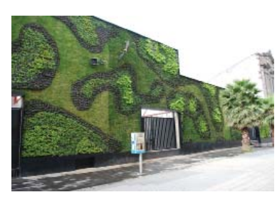
Green wall at the Universidad del Claustro de Sor Juana in the historic center of Mexico City. Kinn anomer plant. The vertical garden is living wall art based on the technical information of

Vertical Gardens are designed using a modular system where each plant has its own cell. Size of vertical gardens can be as small as 10 by 10 inches and as tall as Patrick Blanc's 545 foot creation in Sydney. A couple of commercial companies that have kits for Vertical Gardens are Gravert and Flora Felt. Gravert can be purchased in Anchorage. The kits are designed so that no water or soil comes in contact with the walls on which they are mounted. Because of the increasing interest in Vertical Gardens, many new systems are becoming available using such different materials as: plastic, aluminum,stainless steel and felt.